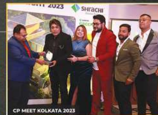
CP MEET KOLKATA 2023