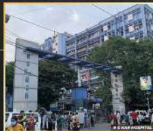
RG KAR HOSPITAL