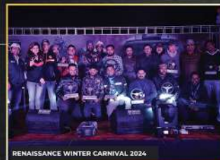
RENAISSANCE WINTER CARNIVAL 2024