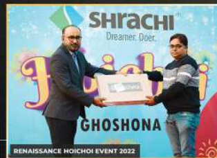
RENAISSANCE HOICHOI EVENT 2022