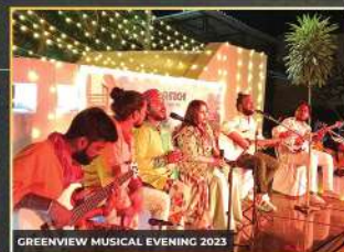
GREENVIEW MUSICAL EVENING 2023