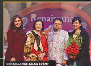
RENAISSANCE JALSA EVENT