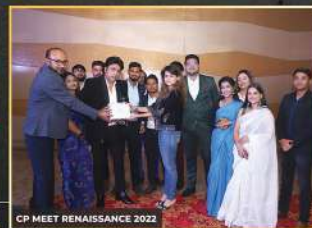
CP MEET RENAISSANCE 2022